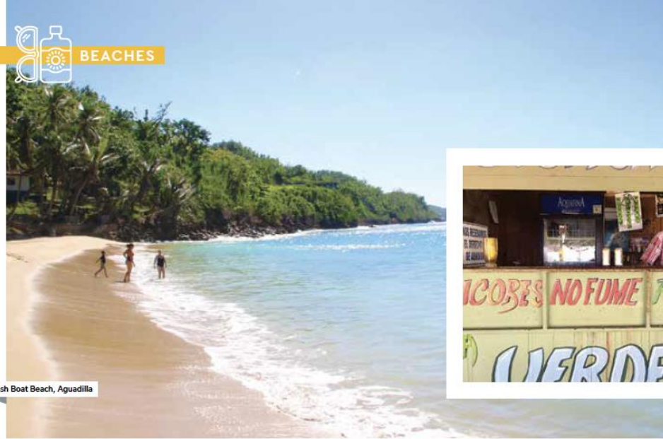
Crash Boat Beach, Aguadilla