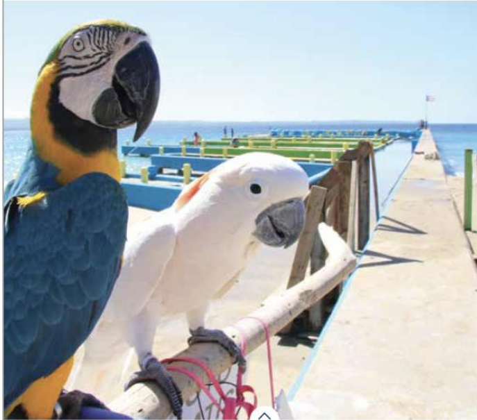
Crash Boat, Aguadilla

forward to joining the line-up at Panaderia La Marina, a bakery with pastries so good nothing could keep customers away; and I made afternoon pit-stops at Tu Mojito, a seaside oasis offering every version of mojito imaginable; and once in a while, I opted to hang out for happy hour with the local gang at Rompeolas, a beach bar and casual eatery.