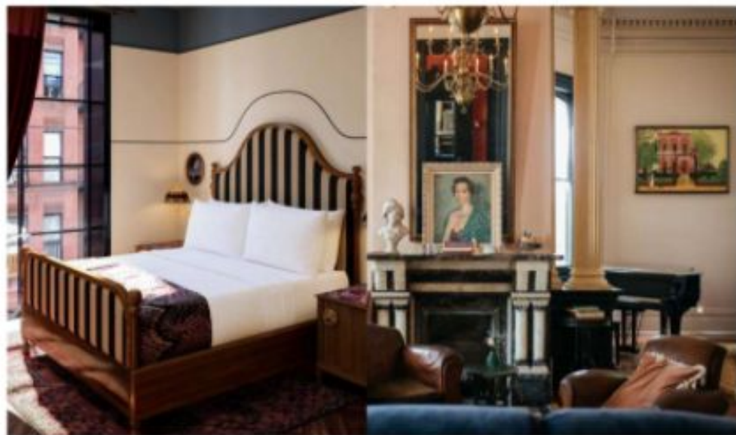
New boutique hotels opening in 2021 including Life House Bushwick (left) and Columns (right)

Author of GIRLS WHO TRAVEL . I write about luxury travel and high-end food and drink.