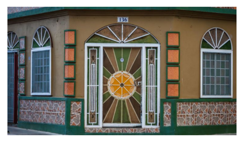
The old town of the city of Ponce in Puerto Rico

Puerto Rico's second city is a showcase of ebullient architecture, impressive art and poignant museums, including the lavish home of the Don Q rum empire, Castillo Serallés.