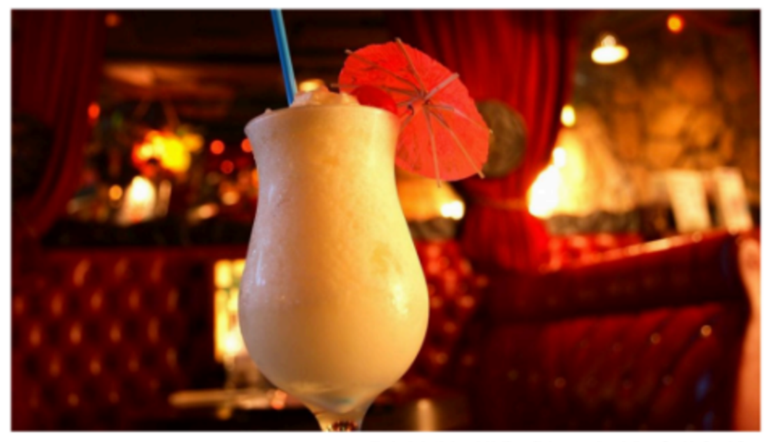
We take a look at the legacy behind Puerto Rico's most popular cocktail.

Today is National Piña Colada Day in Puerto Rico, the birthplace of this much-loved cocktail. The island was officially given that title back in 1978, when it was recognised for being home to the key ingredient Bacardi - and as the world's overall largest exporter of rum.