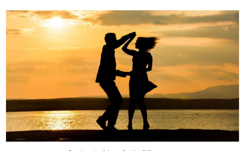
Dancing salsa

Learn to dance, check out a salsa club or just sit back and enjoy the pros on the island that was home to El Cantante , Gran Combo and Ricky Martin.