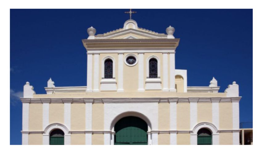
San German Cathedral in San German, Puerto Rico

Soak up the colonial history in this charming old town, with ornate mansions and delicate churches harking back to the boom days of sugar and coffee.