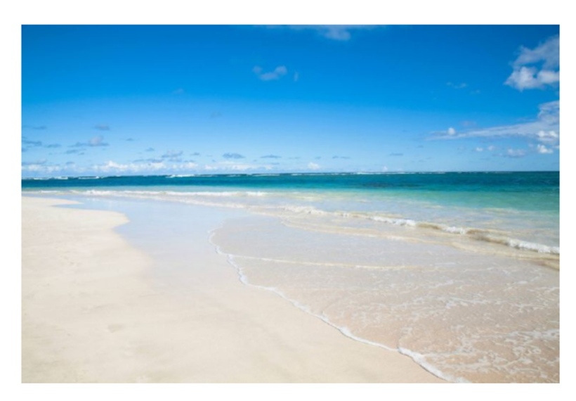
Viegues, Puerto Rico

Tour the mesmerizing beaches of Vieques, precious slices of untouched Caribbean wilderness.