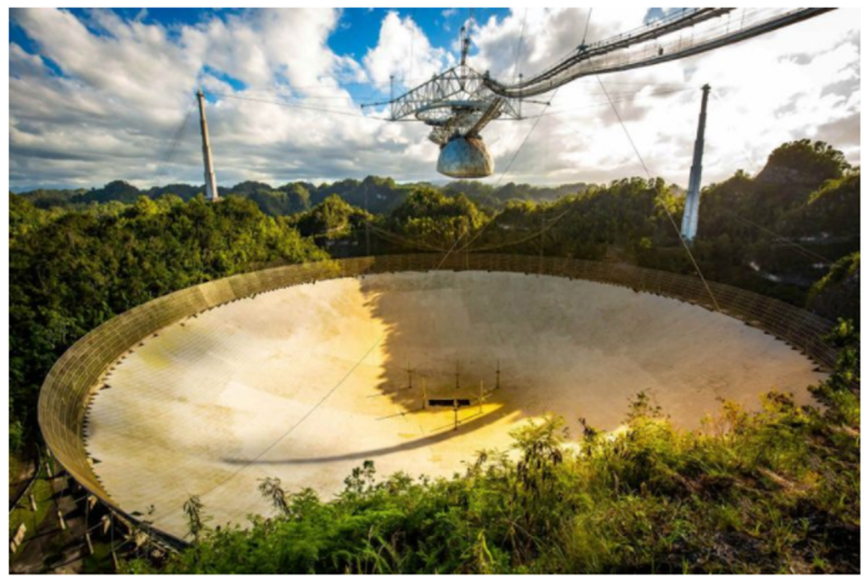
Large radio telescope dish in Arecibo national observatory

The world's largest radio telescope is an awe-inspiring sight, with plenty of thought-provoking exhibits on hand to satisfy budding scientists and aspiring astronauts.