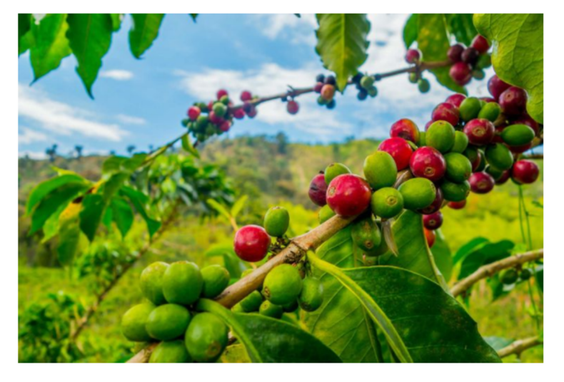
Coffee plantation

Puerto Rican coffee once supplied the Vatican, and today the island's fertile soils and ideal climate are fuelling a resurgence in potent, gourmet brands.