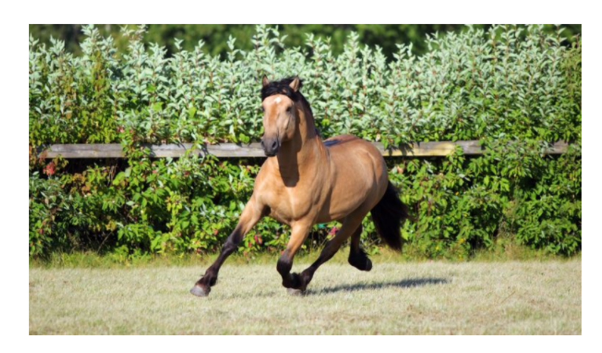
Paso Fino horse

Ride these friendly horses along the beach or through the jungle and experience their exceptionally smooth gait.